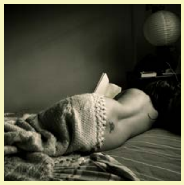
€350/M | € 3.750/Y

A long-term exploration of self-love, confidence, and transformation.